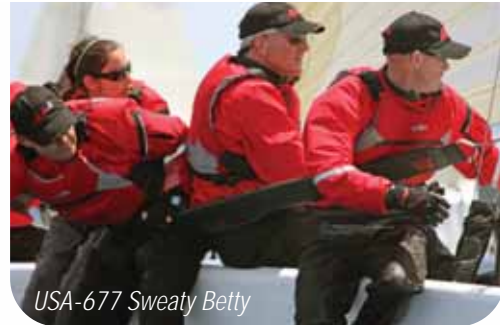
USA-677 Sweaty Betty

The next opportunity to experience an event like you've never experienced before will be in Annapolis, Md. at the 2008 North American Championship on October 26 - November 2, then in 2009 at the Worlds on October 27 - November 7 — same boat, same venue, same awesome, world-class Melges 24 style racing! Visit the official event website and register online to compete at annapolismelges24.com .