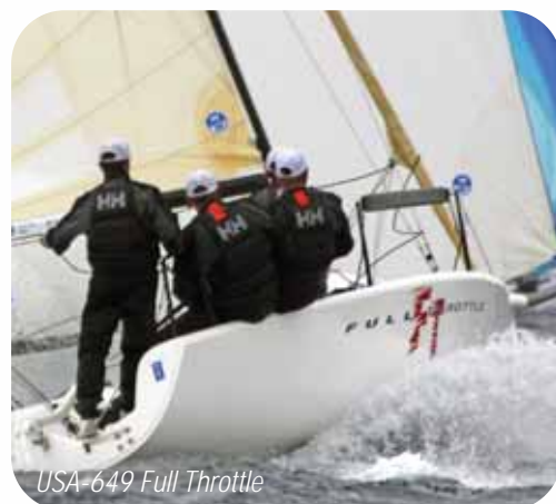
USA-649 Full Throttle