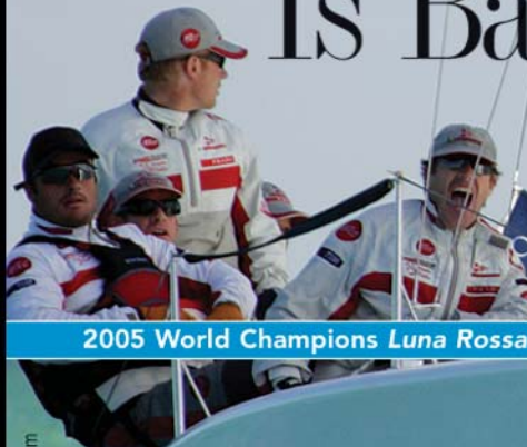
2005 World Champions Luna Rossa