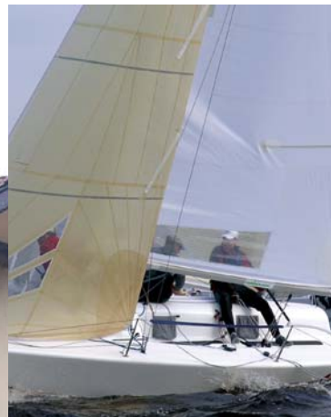
Hot, Melges 24 racing action is almost always guaranteed at the King's Day Regatta/Atlantic Coast Championship.