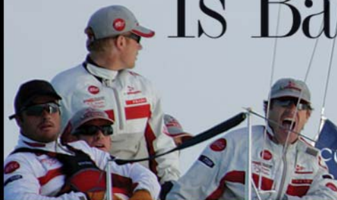
2005 World Champions Luna Rossa