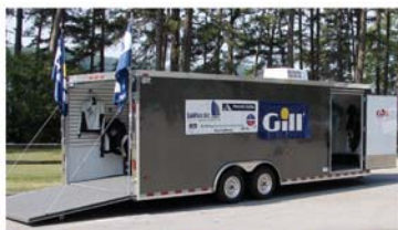
Onsite at M24 Nationals!