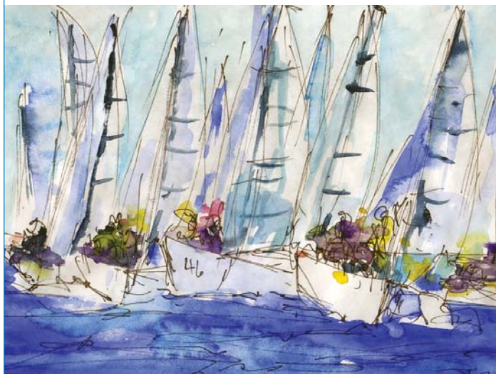
Melges 24 Fleet Action (artist sketch)

featuring the exquisite, fine art paintings of