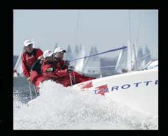
Photo Full Throttle #1 at the 2004 Ocean Reef Club Champs in Key Largo

Heading to Key West? World's fastest Melges 24 sails in stock. Call our experts today!